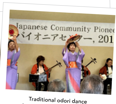
Traditional odori dance performed at Japanese Community Pioneer Center Shinnenkai