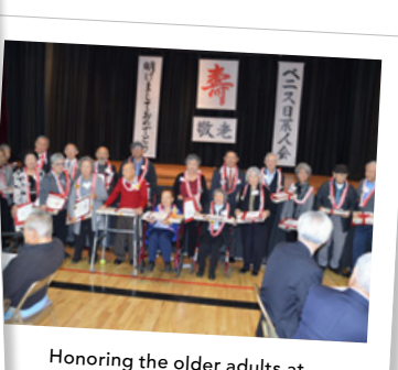
Honoring the older adults at VJCC Shinnen Kai and Keiro Kai